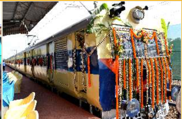
Inauguration of Ambikapur-Anuppur MEMU by the then Minister for Railways through video conferencing from Rail Bhawan, New Delhi