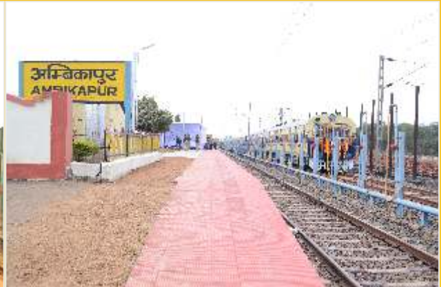
Platform Shelter provided at Ambikapur Station