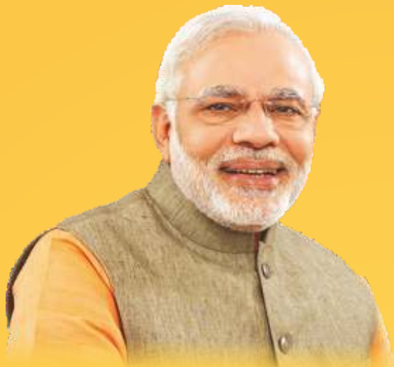
Shri Narendra Modi