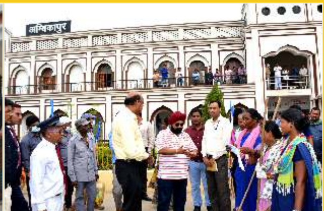
General Manager and other senior officials participated in Swachhata Abhiyan at Ambikapur Station