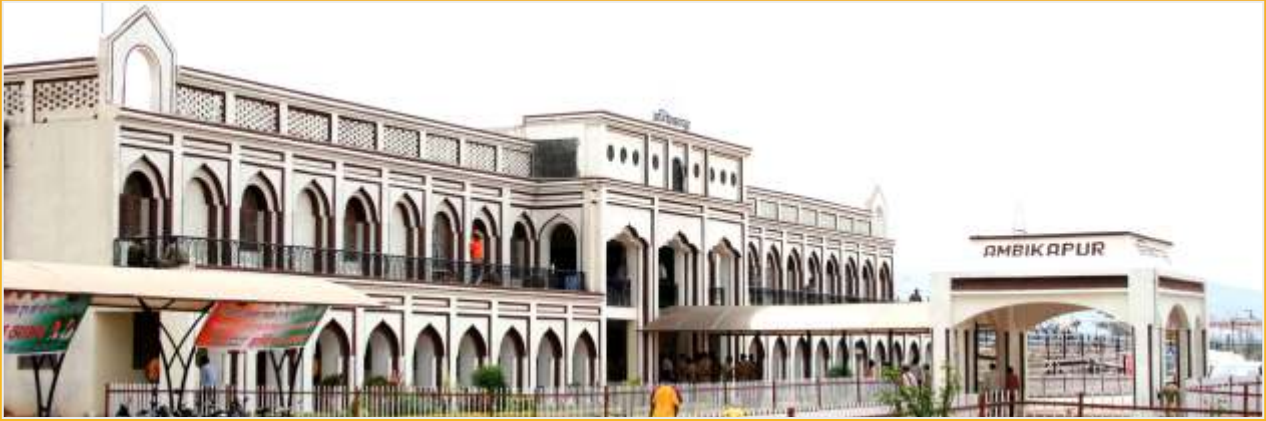
Ambikapur Railway Station