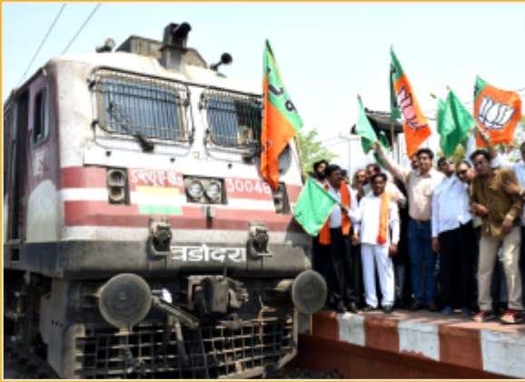
Hon'ble MP & other dignitaries flagging off Indore-Puri Weekly Humsafar Express at Rajnandgaon Station