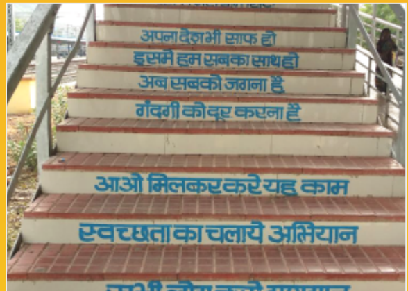
Foot Over Bridge facility at Dongargarh Station