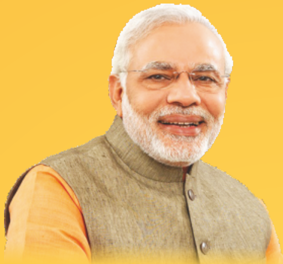
Shri Narendra Modi