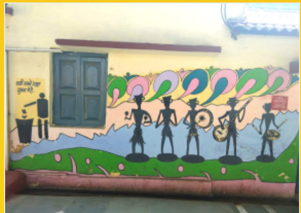
Station beautification by local art at Dongargarh Station