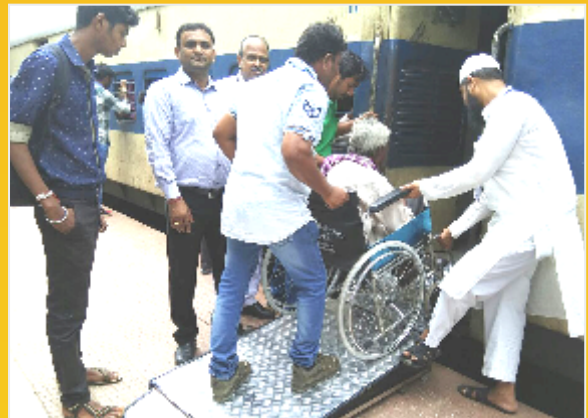
Portable ramp for Divyang passengers provided at Rajnandgaon Station