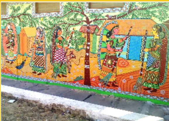
Station beautification by local art at Rajnandgaon Station