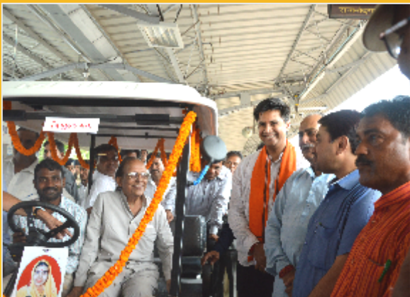
Hon'ble MP inaugurating Battery Operated Car facility at Rajnandgaon Station