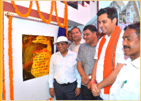
Hon'ble MP inaugurating Foot Over Bridge at Rajnandgaon Station