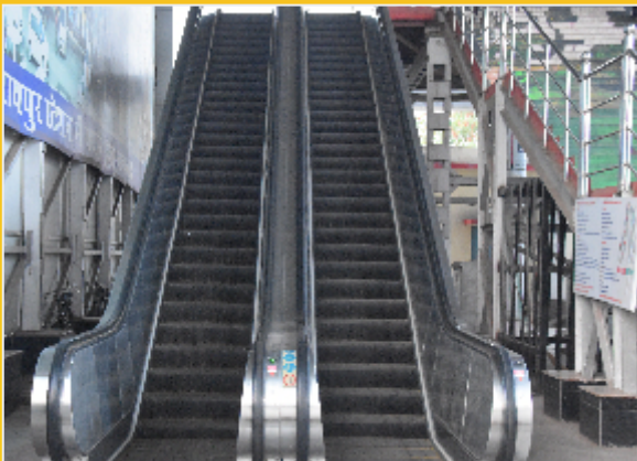
Escalator provided at Raipur Station