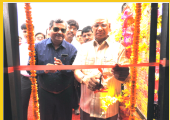
Hon'ble MP inaugurating Solar System at Raipur Station