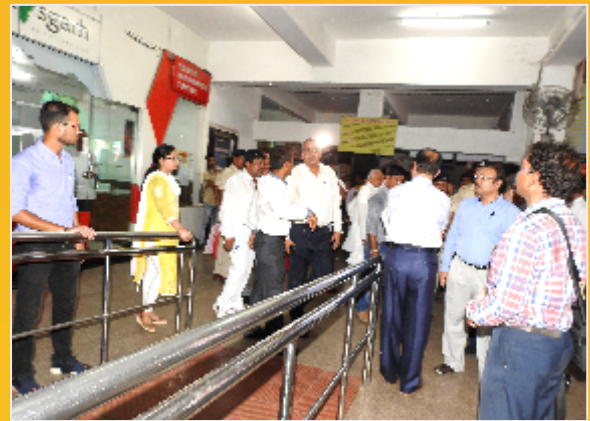
Ramp for Divyangs has been provided at Raipur Station