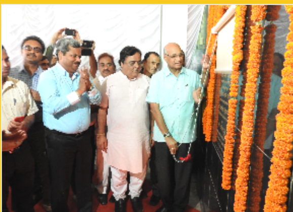
Hon'ble MP inaugurating Lift at Raipur Station