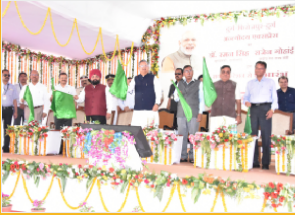
Hon'ble Chief Minister, C.G., Hon'ble Minister of State for Railways & other dignitaries flagging off Antyodaya Express