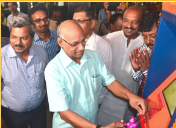
Hon'ble MP inaugurating Automatic Ticket Vending Machine at Raipur