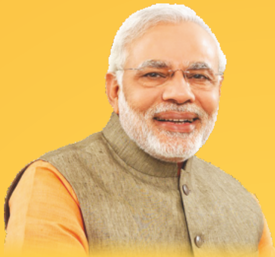
Shri Narendra Modi