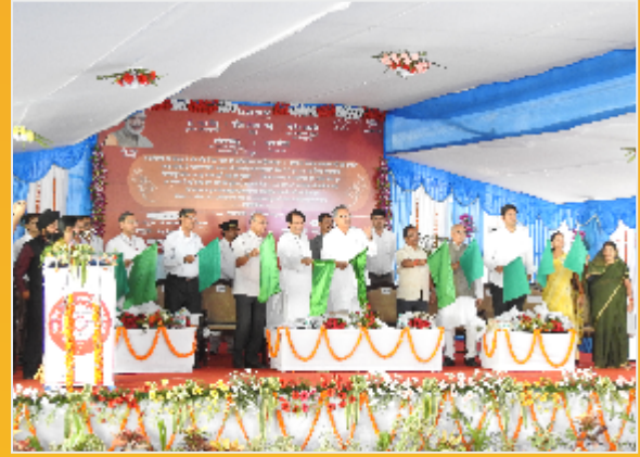
Hon'ble Minister of Railways, Chief Minister, C.G. & other dignitaries flagging off Humsafar Express from Raipur