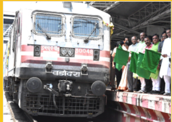
Indore-Puri Humsafar Express being flagged off at Raipur by Hon'ble MP & other dignitaries