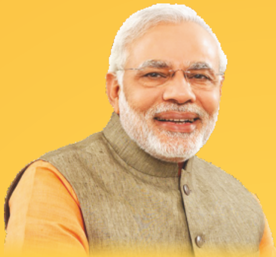
Shri Narendra Modi