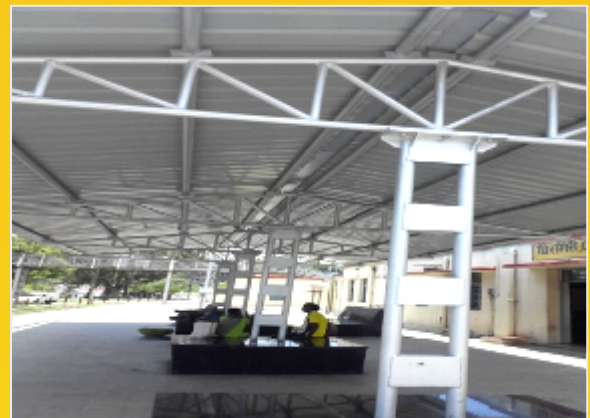
Platform shelter provided at Chirimiri Station