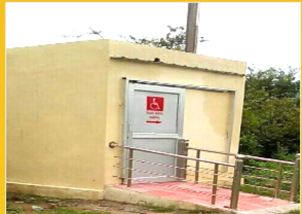
Divyang friendly Toilets at Madwarani Station