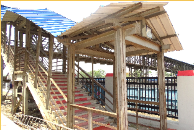
Foot Over Bridge provided at Korba Station