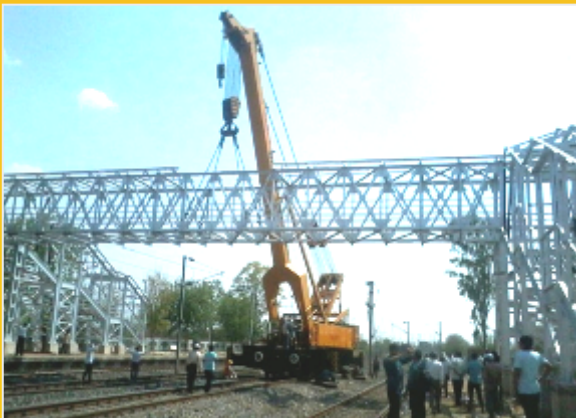
Foot Over Bridge Provided at Madwarani Station