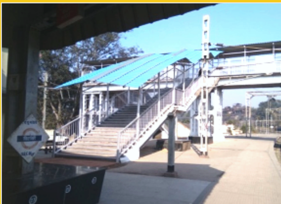
Foot Over Bridge at Chirimiri Station