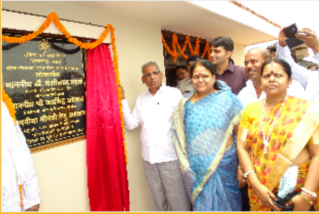
Hon'ble MP & other dignitaries inaugurating Korba station developed as a Aadarsh Station