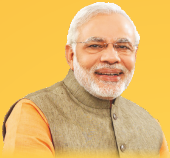
Shri Narendra Modi