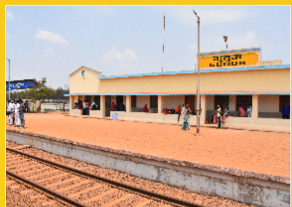
Newly constructed Gudum Station