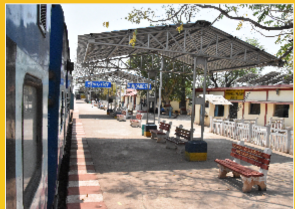
Platform shelter provided at Gunderdehi