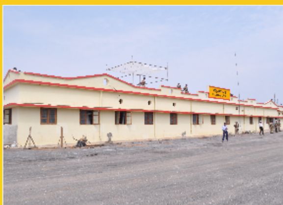
Newly constructed Bhanupratappur Station