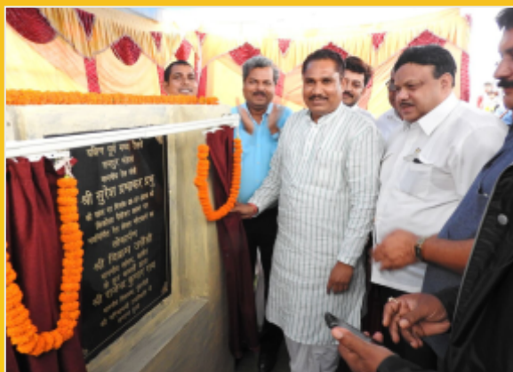
Hon'ble MP & other dignitaries inaugurating platform raising at Sikosa Station