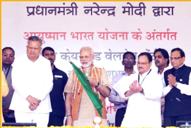
Hon'ble Prime Minister, Hon'ble Chief Minister, C.G. and other dignitaries inaugurating Gudum-Bhanupratappur New line & flagging off New Passenger service up to Bhanupratappur Station