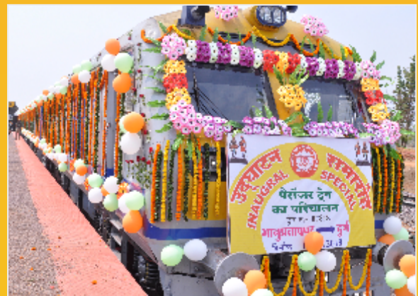
Inauguration of New passenger service between Bhanupratappur-Durg Stations