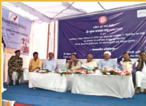
Inauguration of Dallirajhara-Gudum New line & flagging off New Passenger service upto Gudum