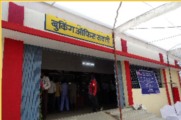
Passenger Reservation Office, Sakti