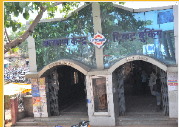
Passenger Reservation Office, Naila