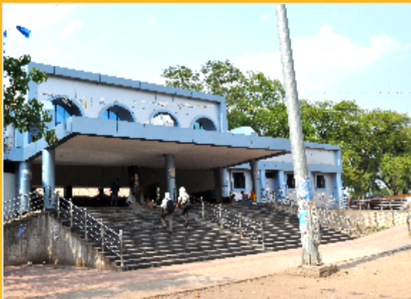
Naila Railway Station