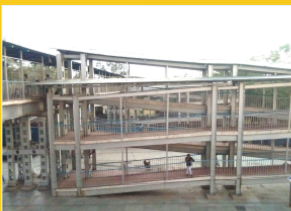
Foot Over Bridge provided at Akaltara Station