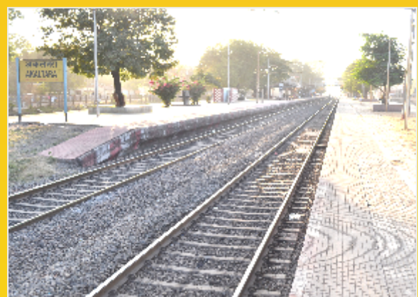
Raising of Platform at Akaltara Station