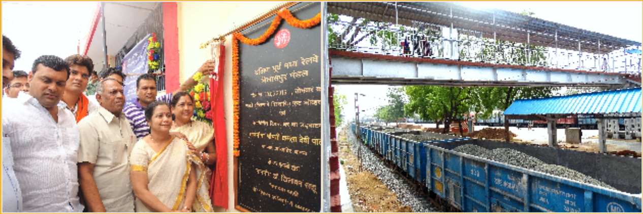
Hon'ble MP and other dignitaries inaugurating Extension of Foot Over Bridge at Sakti Station