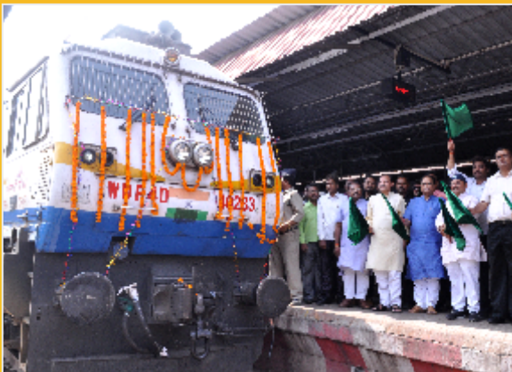
Hon'ble Minister, C.G., Hon'ble MP & other dignitaries flagging off Indore-Puri Humsafar Express at Bilaspur Station