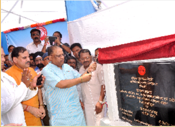
Hon'ble Minister, C.G., Hon'ble MP & other dignitaries inaugurating Road Under Bridge at Tarbahar, Bilaspur