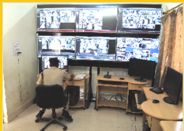
CCTV cameras at Bilaspur being monitored by RPF