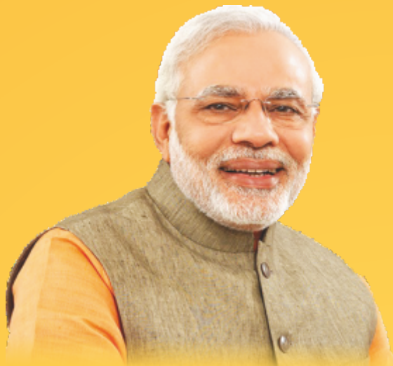
Shri Narendra Modi