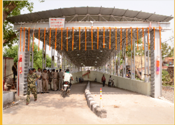
Road Under Bridge at Tarbahar, Bilaspur