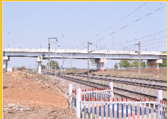
Road Over Bridge between Dadhapara-Belha