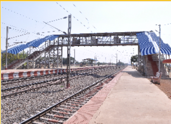
Foot Over Bridge provided at Chakarbhata Station