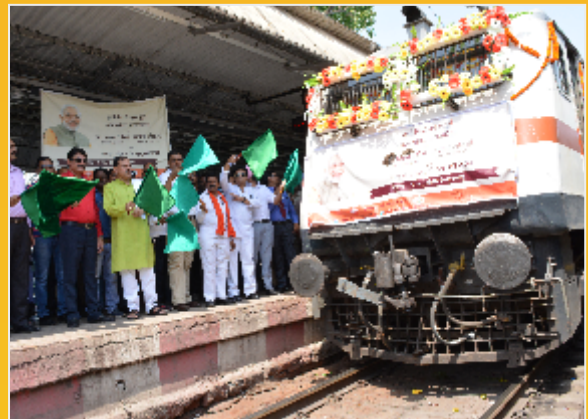
Hon'ble MP & other dignitaries flagging off Durg-Firozpur Antyodaya Express at Bilaspur Station