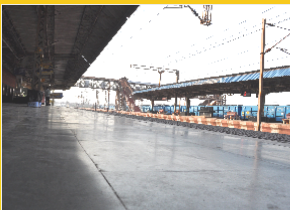
Platform extension at Uslapur Station