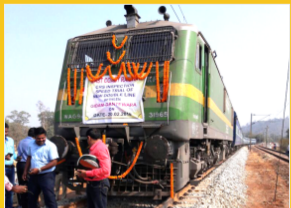
CRS inspection between Gidam-Dantewada doubling