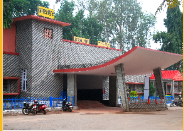
Improved circulating area at Jagadlur Station