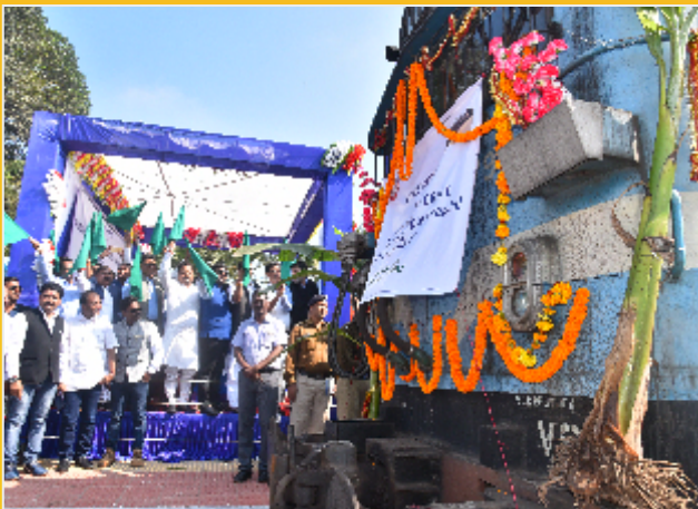
Extension of Visakhapatnam-Jagdalpur Special Train Service upto Kirandul at Jagdalpur Railway Station