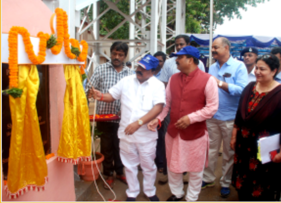
Hon'ble MP inaugurating Foot Over Bridge at Jagadlur Station