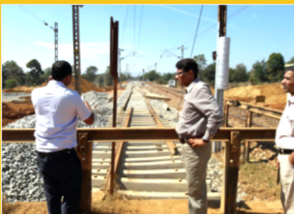
Doubling between Gidam-Dantewada