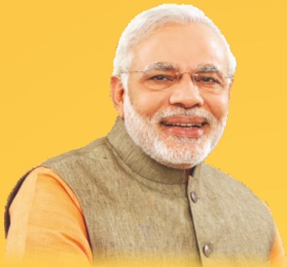
Shri Narendra Modi